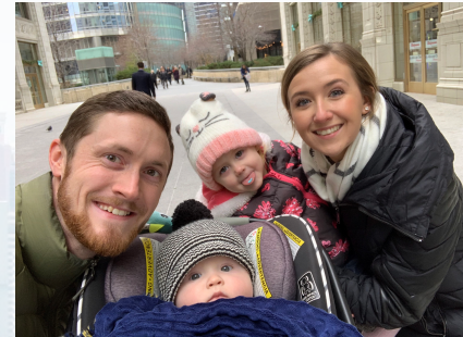
Success at the consulate!